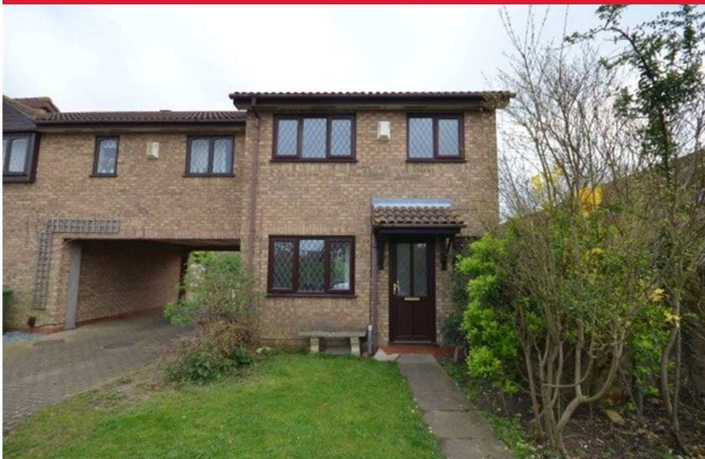
The Rowans, Milton